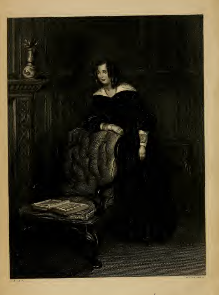
I love I I love I and commot tear My o out from a mother's old arm chair Phiceloob The Old Arm Chair